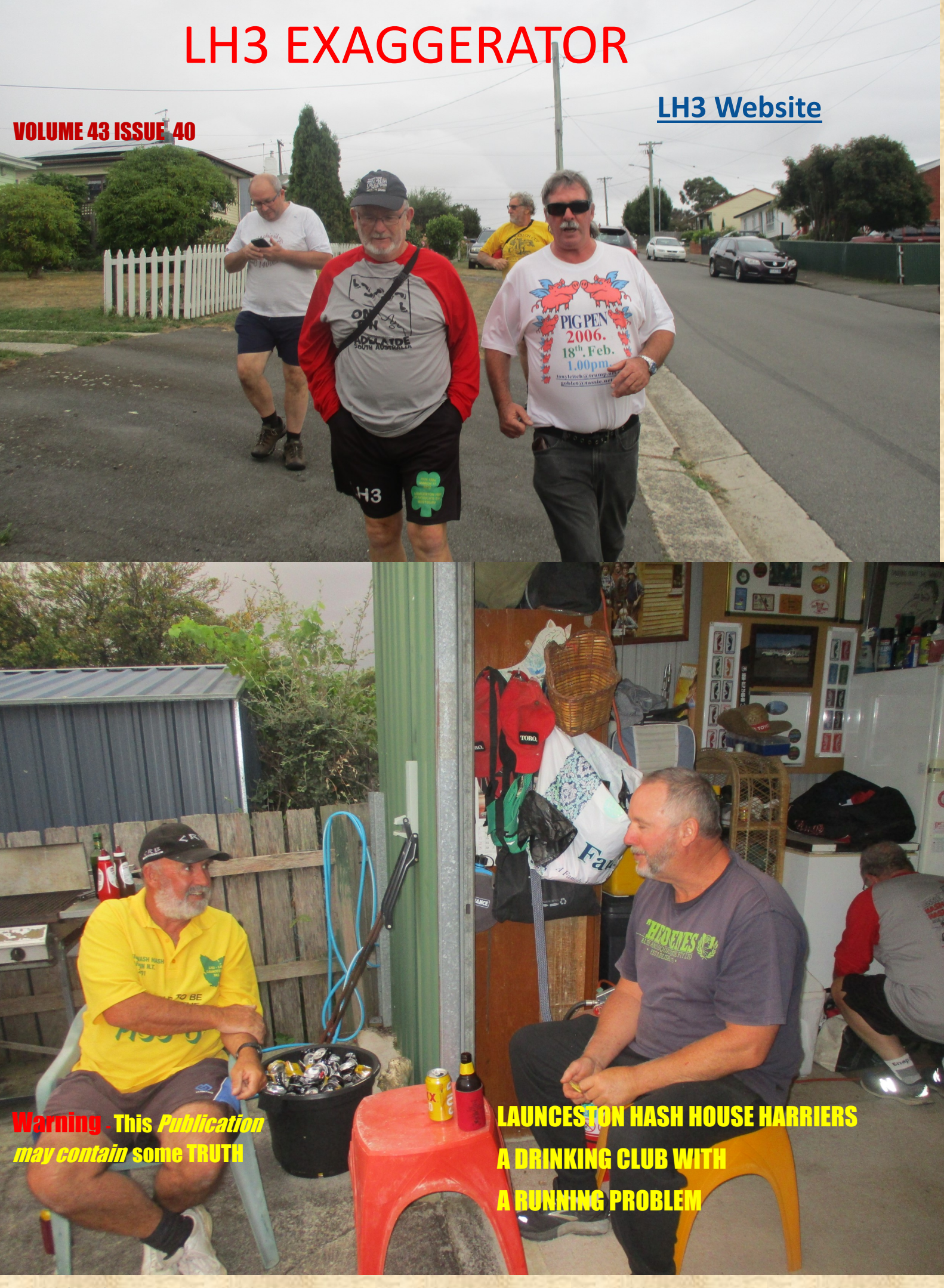
RUN No. 2571 13 Fryett St Waverley Hare: Bendover